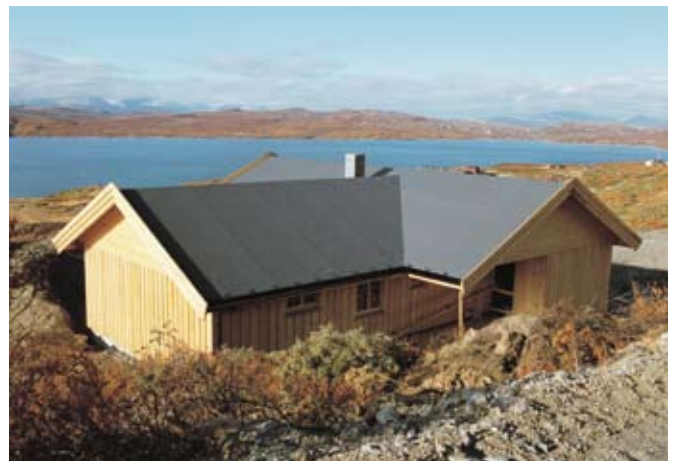
Protan Turf Membrane prior to planting

Protan AS in Norway, have been producing roof coverings and membranes for exposed roofs, wet rooms, terraces and turf roofs since 1972.