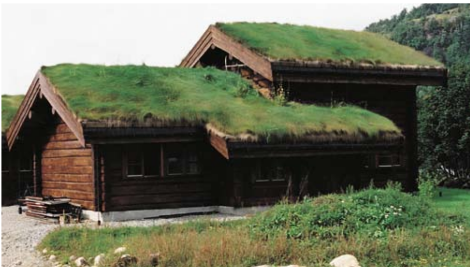
Protan Turf roof after planting